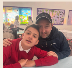
HEAD TEACHERS BLURB