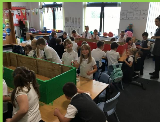
We built bird houses, feeders and painted our planters.