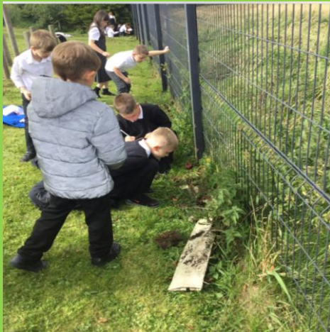
We completed a survey to see how many birds and bugs we have in our playground.