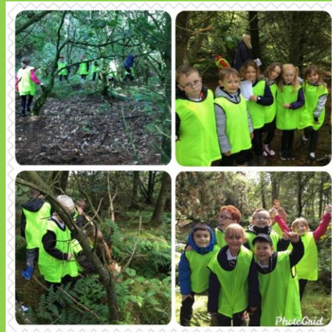
We went to the Wanderer Woods to compare different features of an ideal habitat.