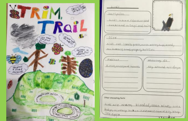
We made a poster about different habitats and wrote a report about the bugs and birds we learned about.