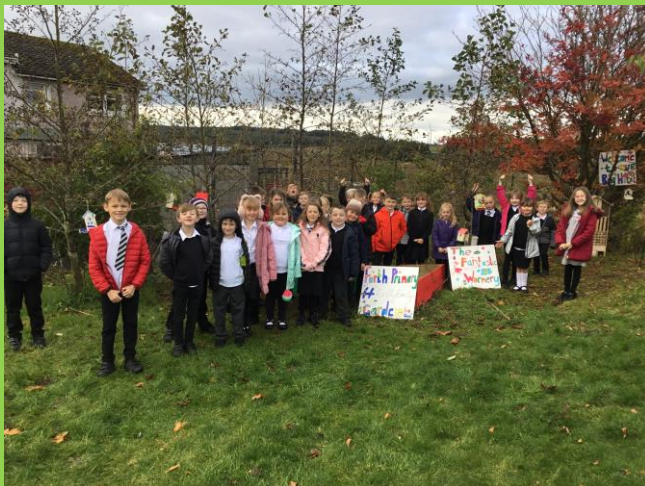
We installed our wormery, bug hotels and set everything up outside.