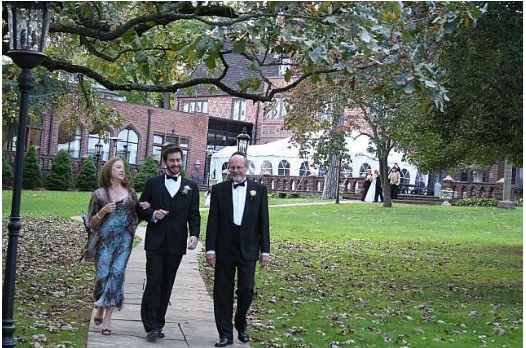
The groom arrives escorted by his parents.