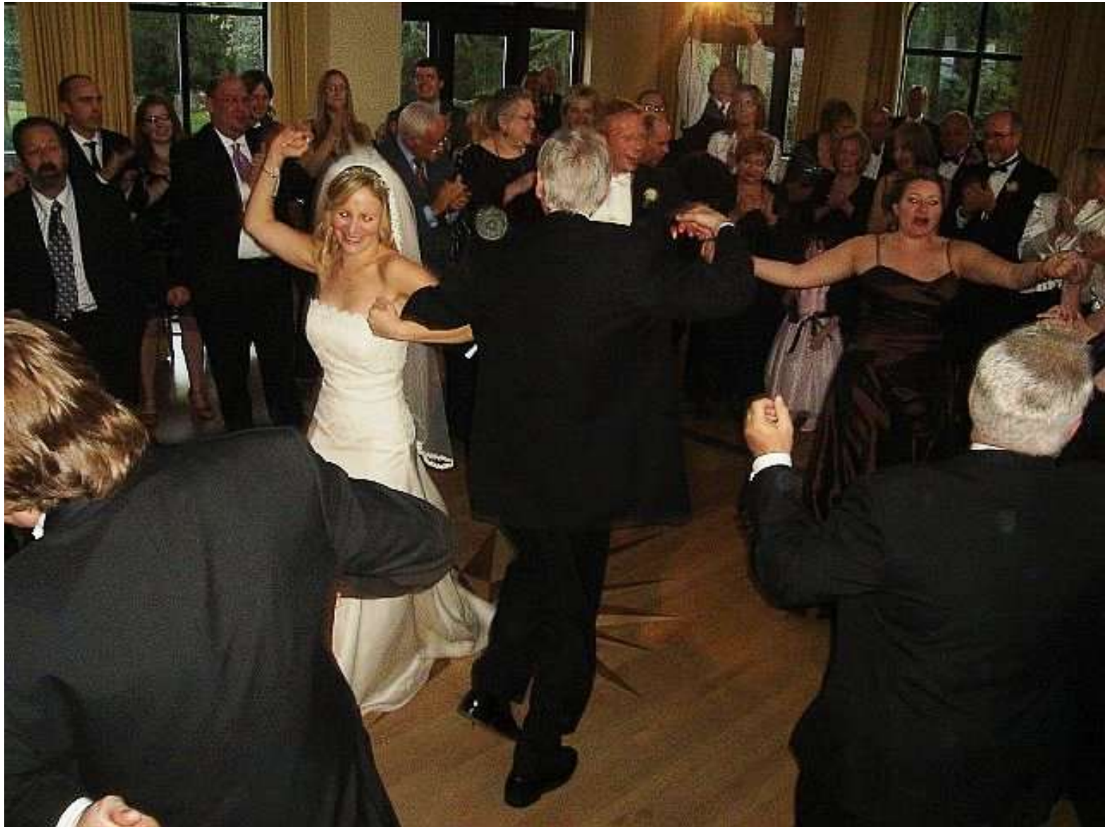
Many of the dances are traditional. Here the bride is seen dancing with her father.