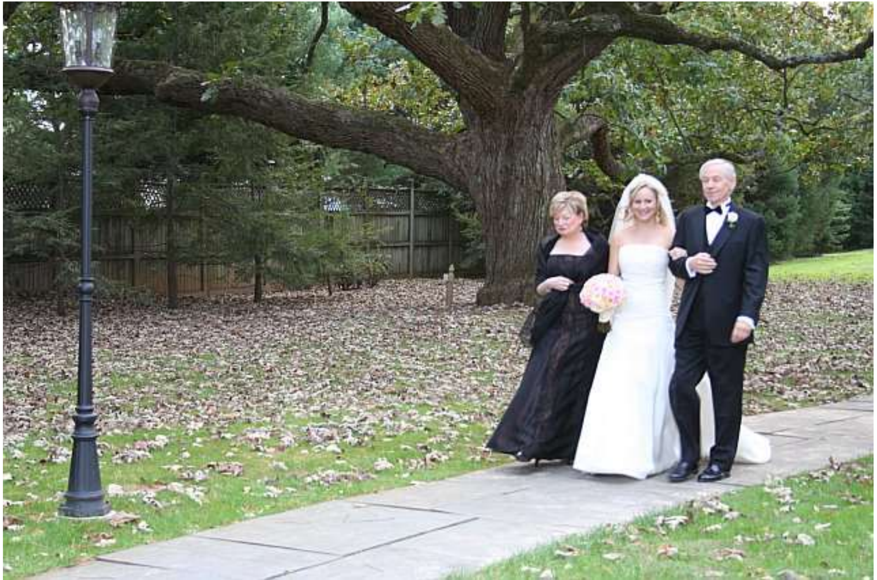
The bride walks down the path with her mother and father on either side.