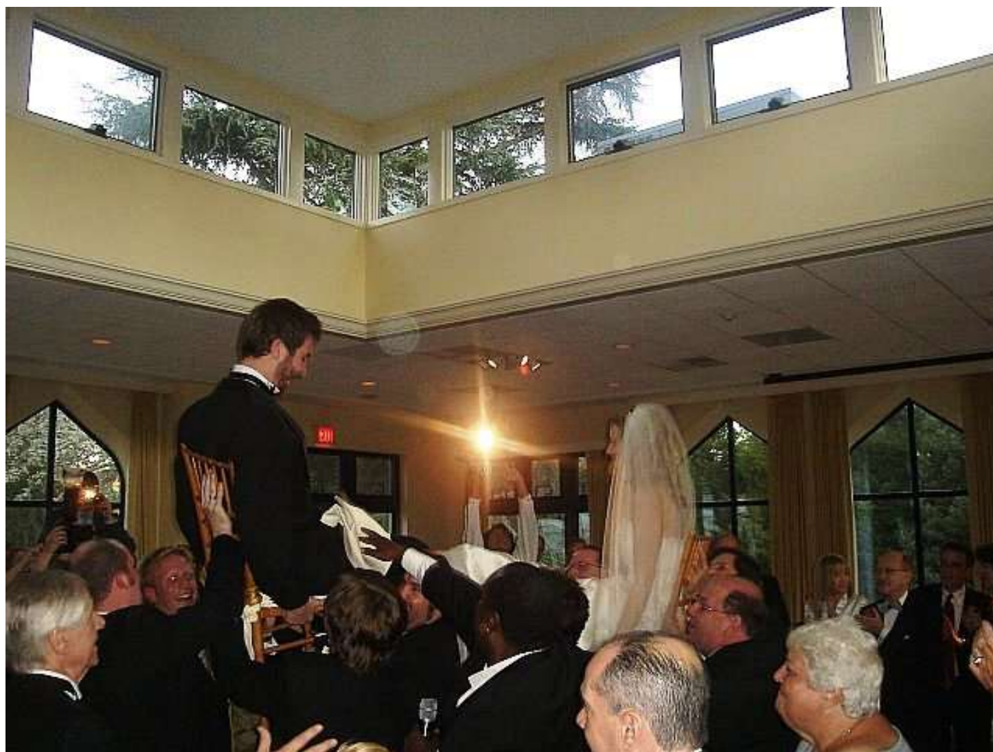
At the end of the dance, the bride and groom are lifted onto chairs and paraded around the room. Everyone claps.