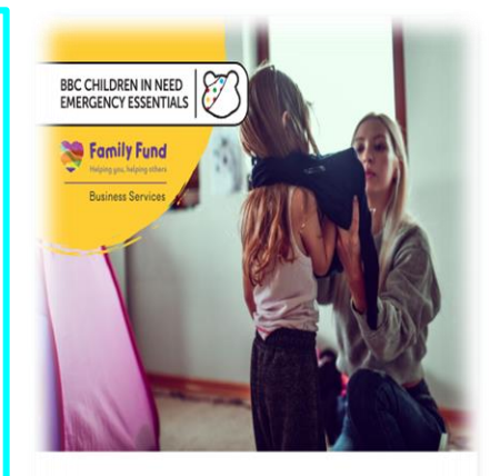
BBC Children in Need Emergency Essentials Programme