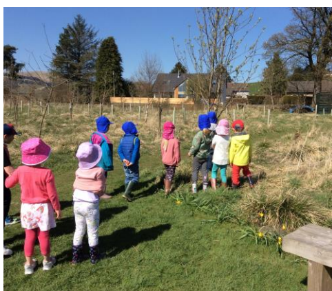
Exploring local woods

We want children to develop the confidence and independence to explore and enquire, to try something new, to ask questions and to seek answers and to apply their learning to discover and learn even more.