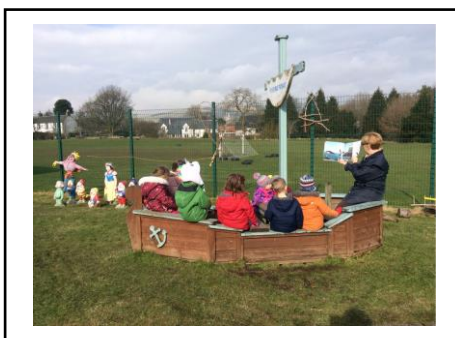
Stories outside in our boat!

If you are not satisfied, you may contact Education and Children's Services - Complaints, at Perth Council, 2 High Street, Perth, or by telephone on 01738 476755. They can also be contacted by e-mail - ecscomplaints@pkc.gov.uk Alternatively you may contact the Care Inspectorate using their complaints procedure. They can be contacted on their national enquiries line 0345 600 9527 or by visiting their website at www.careinspectorate.com